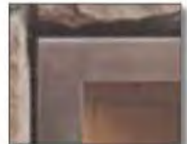
Hand-Rubbed Antique Nickel Trim